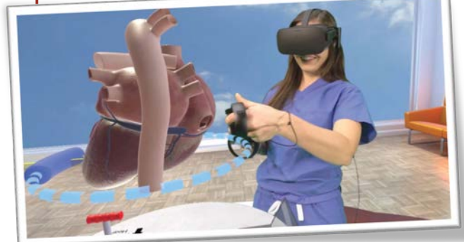
In-coming Fellows from various programs come together for a weekend of hands-on learning, including sessions with The Stanford Virtual Heart

All travel, hotel, meals and registration fees provided for incoming first year fellows! Only 40 spots are available, so apply today!